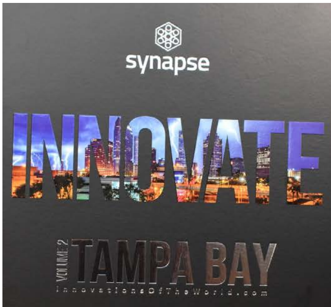
Silver Foil Embossing

Logo embossing can be done in a prestigious one tone foil embossing or a full color print. Please provide the logo you would like to use for your front cover logo (preferably in .eps format).